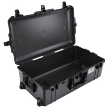
1615NF No Foam