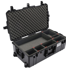
1615TP With TrekPak Divider System