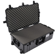
1615WF With Foam