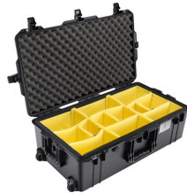
1615WD With Padded Dividers